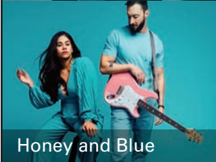
Honey and Blue