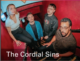
The Cordial Sins