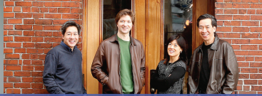
Ying Quartet & Push Physical Theatre Mar 26, 2022