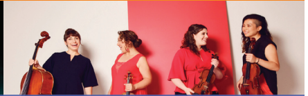
Aizuri Quartet Nov 13, 2021