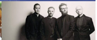
Brooklyn Rider May 21, 2022

TICKETS: CbusArts.com or call 614-469-0939