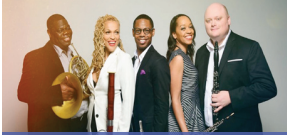
Imani Winds Feb 19, 2022