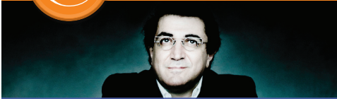
Sergei Babayan, Pianist Oct 23, 2021