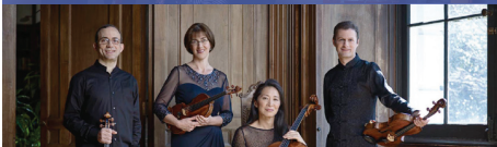
Brentano String Quartet & Dawn Upshaw Apr 30, 2022